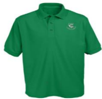
PE top in green, red, purple, yellow or blue