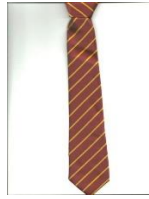
School Tie with white shirt